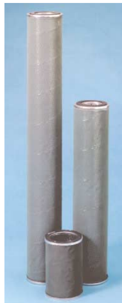
Teflon ® Coated Separators