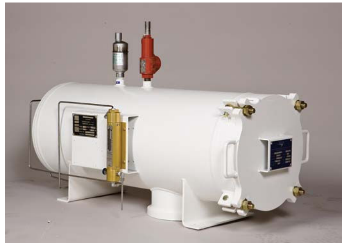
Model No. HV1633M A fully-qualified 300 USGPM Filter/Separator. End Opening unit is only 16 inches in diameter and 47 inches long.