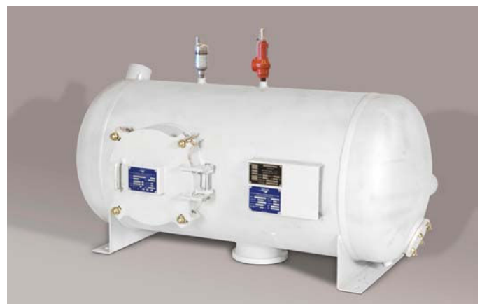
Model No. HVS2228M A fully-qualified 510 USGPM Filter/Separator. Side Opening unit is only 22 inches in diameter and 65 inches long.